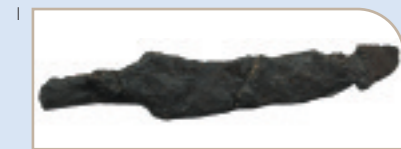
1. Iron knife Early medieval iron knife from Faughart Lower .

Some of the finds from sites north of Dundalk.