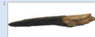
2. Iron knife Early medieval iron knife with handle from Faughart Lower .