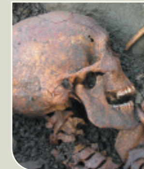
Detail of skeleton uncovered at Faughart Lower .