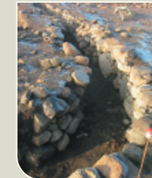
Curving length of souterrain at Faughart Lower .