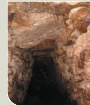
View inside the preserved souterrain at Drumad with plant roots hanging from the ceiling.

As the site expanded, some enclosure ditches were backfilled, re-dug, lined with stone and eventually had walls built on top of them. The early phases did not seem to include human burial but later a small area - about 15 m by 15 m - was set aside for a concentration of superb stone lined and capped 'long-cist' graves. As burial continued, the graves became more 'stone lined' and eventually there was a mass of simple earth-cut graves.