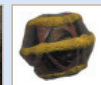
4. Glass bead Early medieval glass bead from Faughart Lower .