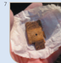
7. Bone comb Fragment of a bone comb from Faughart Lower .