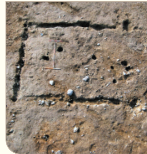
Neolithic building uncovered during excavations at Plaster .