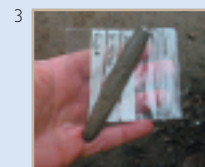
3. Lead ingot Lead ingot from Faughart Lower , possibly cast on-site.