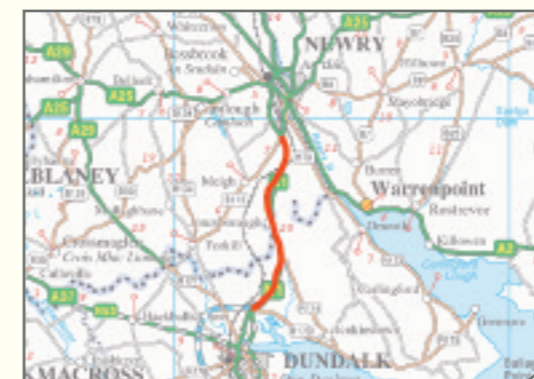
© Ordnance Survey Ireland & Government of Ireland permit number EN 0045206.