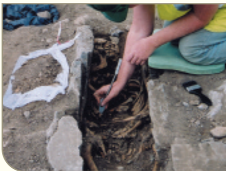
Archaeologist excavating a burial at Faughart Lower .

The A1/NI Newry-Dundalk Link is 14 km with 5.7 km of link roads. It starts from Cloghoge roundabout in Co. Armagh near Newry in Northern Ireland and extends to the Ballymascanlon roundabout near to Dundalk, Co. Louth .