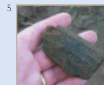
5. Neolithic pottery Decorated Neolithic pottery from Aghnaskeagh .