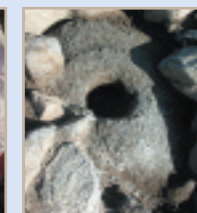
8. Quernstone Granite quernstone, part of a deliberate backfilling to the souterrain at Faughart Lower .