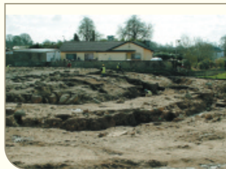
The low knoll converted into an early medieval settlement at Faughart Lower .