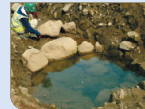
The flooded base of a well sunk through one of the backfilled ditches at Faughart Lower .

The site also contained two souterrains. The first of these underground passages was a 'double ender' with a constricted entrance at one end and an exit into the outer enclosure wall. Due to high bedrock, part of the 40 m long chamberless souterrain may have been 'hidden above ground', inside one of the inner enclosure banks. As the souterrain was built across two earlier, backfilled ditches it eventually started to subside and was re-lined in places. Finally, it was completely backfilled. The backfill included a plough share, several ring pins and what appears to be deliberately placed pieces of rotary quern-stones.