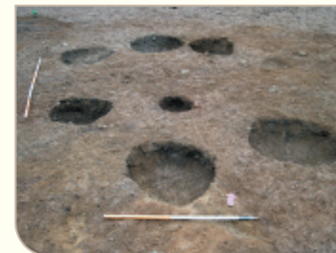
Prehistoric Pits uncovered during excavations at Faughart Lower .

Neolithic or possibly early Bronze Age activity was sited next to a stream at Faughart Lower . Three unusual arrangements of a circle of shallow 'cremation-type' pits around a central hearth were uncovered. In one these a substantially complete pottery vessel was recovered. Next to one of the monuments an arc of stake-holes may indicate a windbreak or part of a hut. Several pieces of burnt bone recovered from some of the pits appear to be human. Other pits showed no evidence for burial and may have been used for cooking. The combination of cooking pits, buried pottery vessels, buildings and cremations on sites of this period was also seen on the M1 Dundalk Western Bypass .