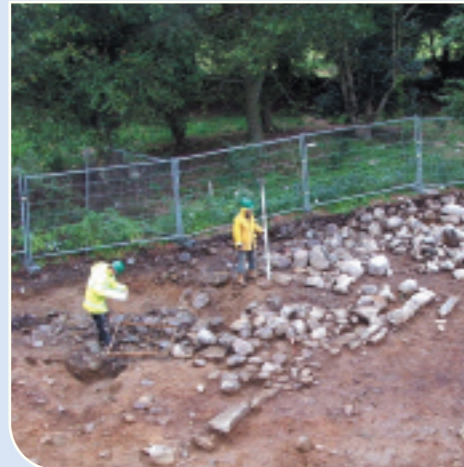
Archaeologists recording the Aghnaskeagh Long Cairn.

The kerb for the monument appears to have been rebuilt once. Left untouched - perhaps out of respect? - was a circular side chamber set within the monument's bulk.